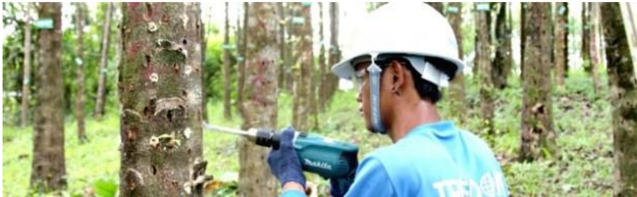
The inoculation process

Almost anyone who has land can venture into this business. It is very much encouraged by MTIB as a great alternative to overcome the scarcity of this valuable bioresource. PENGHARUM (Association of Bumiputra Gaharu Entrepreneurs) is also one of the many associations that encourages and assists Bumiputera agarwood entrepreneurs in sharing knowledge and upgrading their technical, management and marketing skills in agarwood plantation.