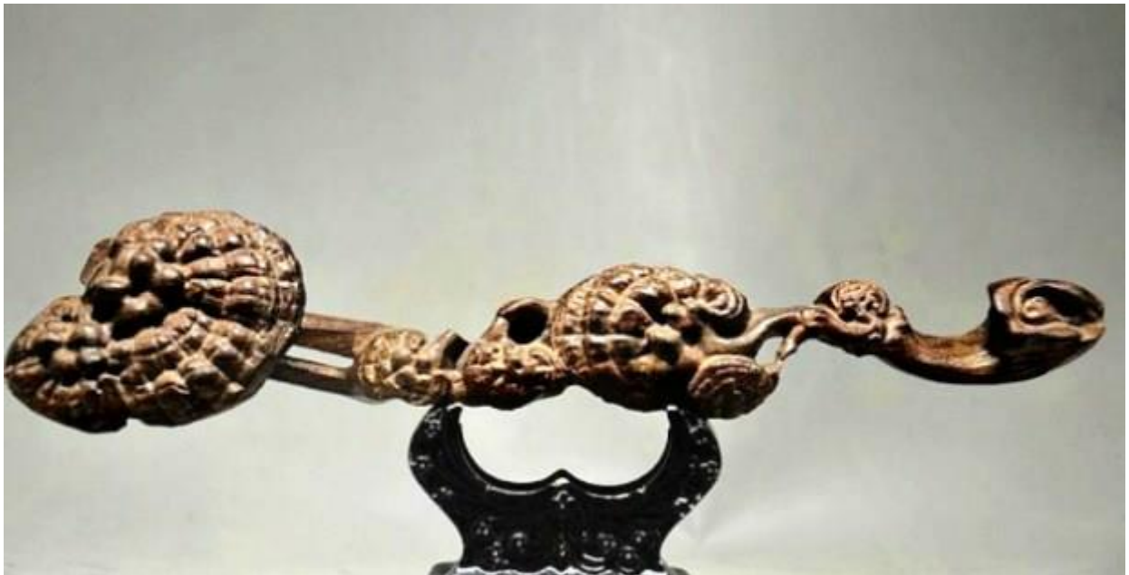
Agarwood hand crafted wood sculpture

Feng Shui, to impress their guests, for traditional medicine and also in a form of investment, similar to people who invest highly in art and paintings.