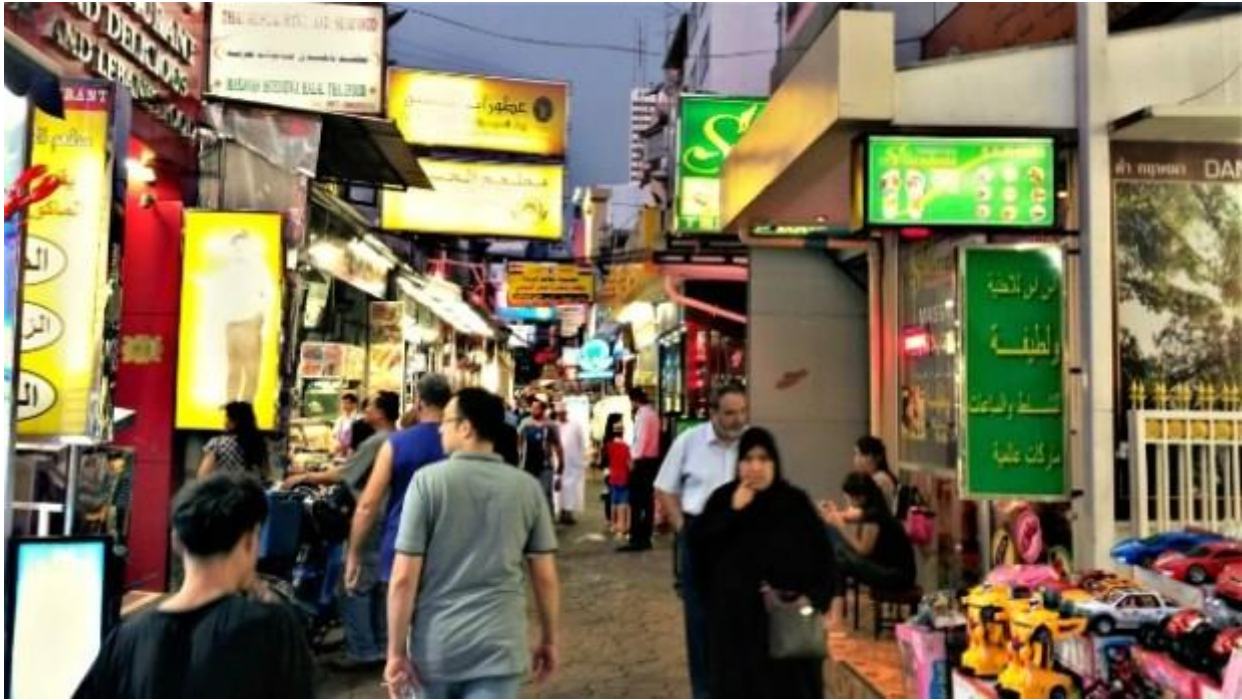
Here is Arab Street in Bangkok

A garwood shops in Bukit Bintang, Kuala Lumpur and in Arab Street, Bangkok for instance, are among the many hot places selling this very hot commodity. It's so intriguing though that most of the agarwood products are from Cambodia, Sri Lanka, and Myanmar, just to name a few places where wild harvesting is banned. It's amusing even when many of them claim that the agarwood chips they sell are "legal". Some say there wouldn't be agarwood business if it weren't for bribery and corruption being in place.