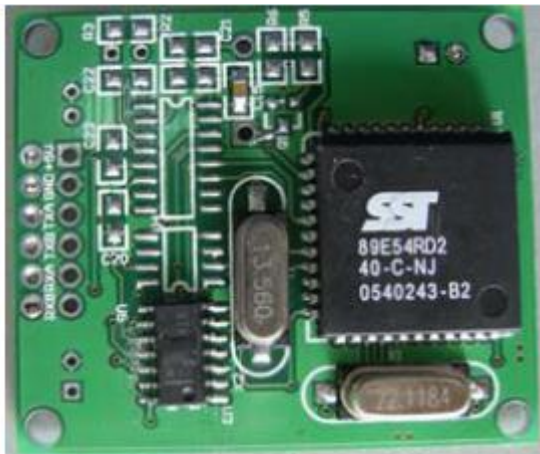
Figure 2.1 : Reader Module RS232

Measuring only 38mm x 45mm, the reader module is ideal for battery operated handheld readers, mobile devices and printers. With a standard RS232 cable plus a USB connector, it is a ready “plug and play” product for desktop solution.