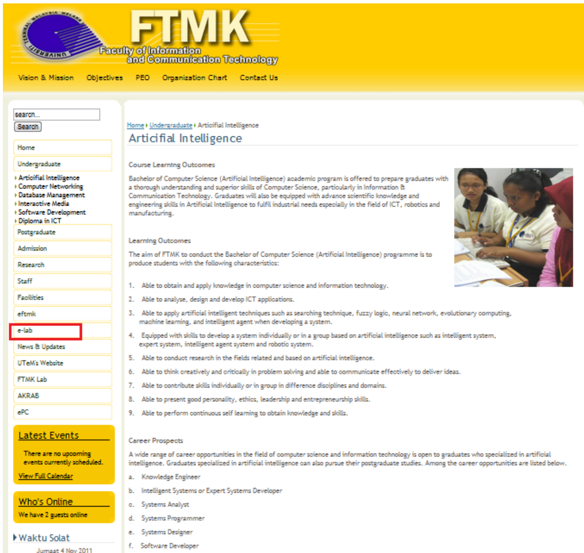
Figure 1.0 : View of homepage show e-Lab

Figure 1.0 user need to choose their e-Lab only. Then user needs to fill in the PERSONAL DETAILS form.