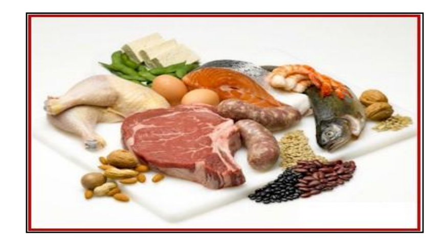
Figure 2.1 Normal protein sources.