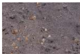
Fig. 1: Original palm oil fuel ash at the mill