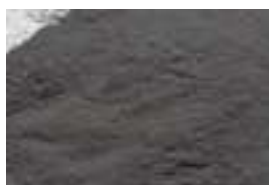
Fig. 2: Finely ground palm oil fuel ash