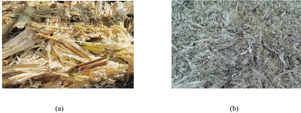
Figure 2: Different states of (a) Raw bagasse (b) Bagasse ash after combustion

calcium silicate hydrate (C-S-H) framework in the cementitious system. Additional formation of this C-S-H framework is beneficial in improving the performance of mechanical strength and durability properties of Portland cement concrete. There are few factors affecting the pozzolanic reactivity of a substance in conventional concrete, e.g. degree of amorphousness, particle fineness, and total amounts of \text{SiO}_2 + \text{Al}_2\text{O}_3 + \text{Fe}_2\text{O}_3 oxide. Higher amount of fine amorphous silica ( \text{SiO}_2 ) in a pozzolan will normally increase its pozzolanic reactivity. Sugarcane bagasse ash (SCBA) is an abundant waste from sugar industry, ethanol and ash produced after burning the bagasse as fuel steam for electricity generation. With high amount of silica, alumina and calcium oxide as the main constituents, SCBA is widely used in cement and concrete due to its high pozzolanic reactivity. Figure 2 illustrates the appearance of raw bagasse and bagasse ash after burning process.