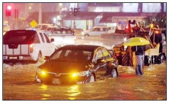
Figure 2: Flash Floods at Jalan Tun Ismail, Kuantan

cesspit the surface runoff generated from urban areas. After the disastrous flood in 1971, Flood Control Commission (FCC) founded by Government took several structural and non-structural steps to cope with serious issue (Chia, 2004). Currently Drainage and Irrigation Department (DID) directing the responsibility for flood control incidences carrying some affective measures with collaboration of other administrations, non- administration agencies, private sectors and societies such as peak flood response, early-warning alert system and restoration of river basins in order to evade the probabilities of catastrophic hazards.