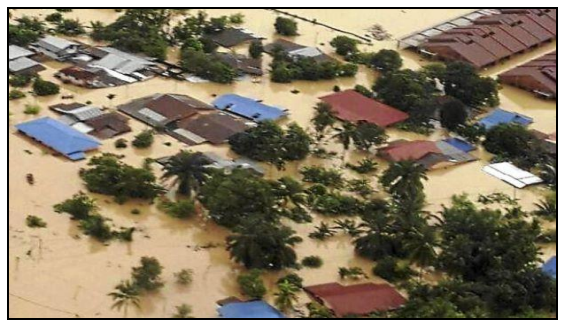
Figure 4: Water logging, Arial picture, Kuantan