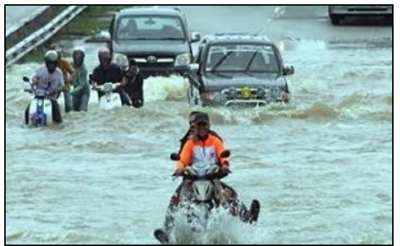
Figure 3: Flash Flood, Kuantan