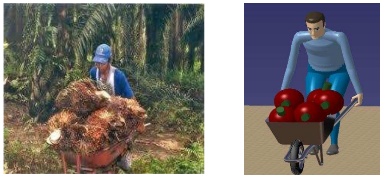
Figure 1. Palm oil workers pushing manually of fully loaded wheelbarrow.

This situation shows that the collectors and loaders are exposed to the risk of having musculoskeletal injury due to their high work demands. Due to the small size of wheelbarrow, large-sized FFBs always fall off the wheelbarrow. Workers had to repeat the work of collecting the fallen fruit and push it back the on the cart. This practice will increase the risk of accidents in the workplace. Therefore, the safety of the collectors and loaders is also an important issue here. A lot of time is wasted in collecting back the fallen FFBs and eventually decreasing the overall productivity.