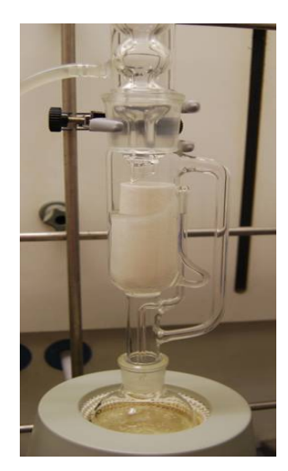
Figure-2. Soxhlet adsorption set up.

Once the adsorption process is completed in, the treated HP-20 was transferred into the soxhlet extraction thimble and polar compounds from sample were extracted from the adsorbent with IPA for 1 hr. Then, followed by carotene extraction using hexane for about 3 hour (adsorbent became colourless). Finally, the solvents were removed from both fractions and concentration of betacarotene was determined by using HPLC. For this soxhlet adsorption method, different ratio of CPO to HP-20 (1:2, 1:3 and 1:4) and IPA extraction time (0, 1 and 2 hour) were studied to determine the optimum conditions to extract the beta-carotene. The optimised experimental conditions were used to extract palm carotene from CPO and OPW. Figure-2 shows the soxhlet adsorption set up.