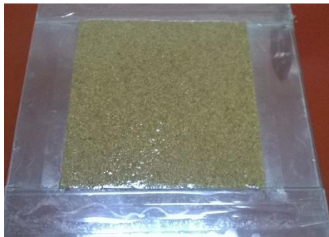
Fig. 1. Mould with dimension 200 mm x 200 mm x 3 mm.

The hand lay-up technique is used to prepare the composites. The epoxy resin (DER 331) and hardener (Jointmine 905-3) was mixed with the ratio of two to one (2:1) and stirred with the short fibres. The resin is then poured into the 200 mm x 200 mm x 3 mm mold (see Fig. 1). The composites were left for curing at room temperature for 24 hours. The volume fraction used in this study for UT fibres were 5% and 20% volume fraction. Treated fibres are using 10% volume fraction for both 1% and 5% NaOH concentration.