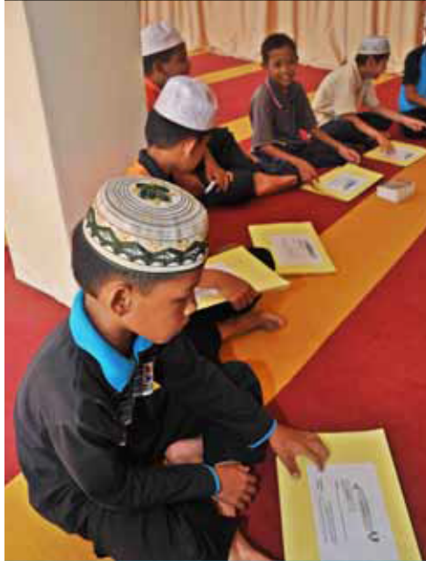
The kids were getting ready for the reading class.

22 May 2010. CMLHS extended its remarkable contribution to the society by organising a Let's Read (Jom Membaca) programme which had taken place at Permata Camar Orphanage (CAMAR), Sungai Soi, Kuantan.