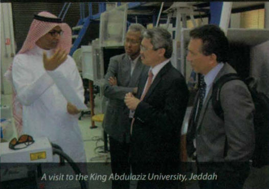
A visit to the King Abdulaziz University, Jeddah