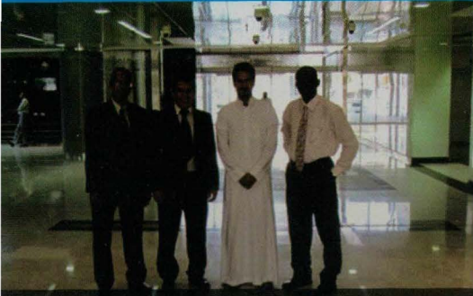
A tour of the King Abdullah City for Atomic and Renewable Energy (KA-CARE), Riyadh