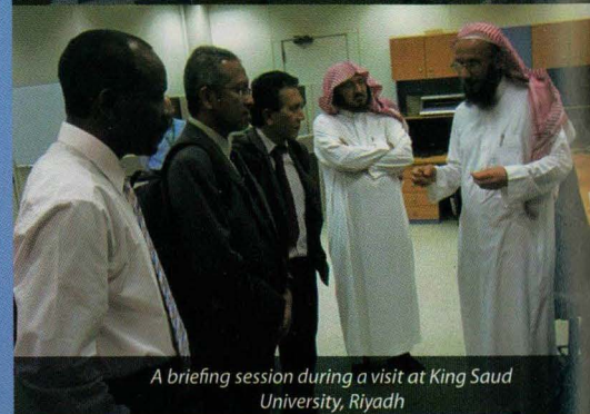
A briefing session during a visit at King Saud University, Riyadh