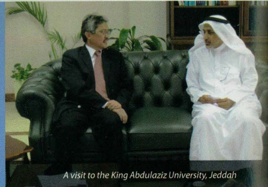
A visit to the King Abdulaziz University, Jeddah