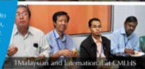
Malaysian and International at CMLHS