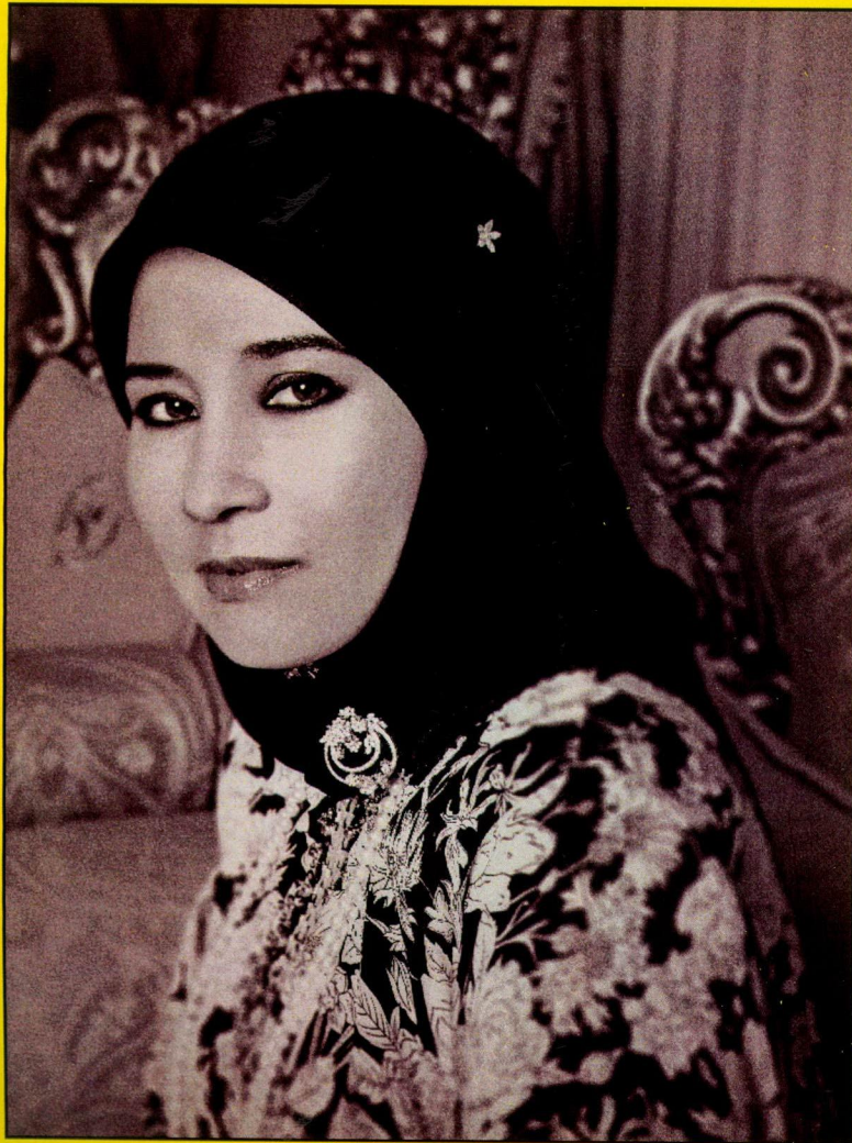
HER ROYAL HIGHNESS THE CROWN PRINCESS OF PAHANG TUNKU HAJJAH AZIZAH AMINAH MAIMUNAH ISKANDARIAH BINTI ALMARHUM SULTAN ISKANDAR AL-HAJ DK., DK (JOHOR)., SPMJ.