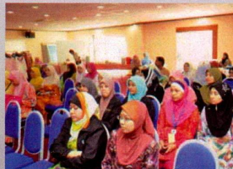
13 May 2011 - Knowledge sharing and exchanged ideas...Mother's Day 2011