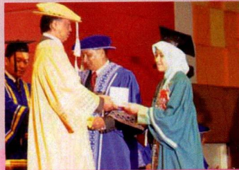
1 October 2011 - The inaugural conferment of Srikandi Matahari Award on the occasion of the sixth Convocation Ceremony of UMP