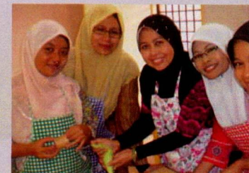
17 May and 18 June 2011 - Learning to make and bake muffins and cupcakes...cooking class at Paya Besar Community College.