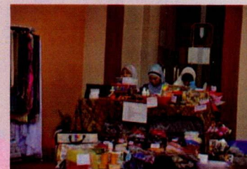
15 July 2011- Women Entrepreneurs Carnival