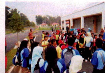
April- December 2011 - Sinar ECER, a community service project to enhance rural students' motivation and academic performance.