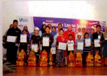
29 October 2011 - Introducing ICT and social network to single mothers and orphans: a joint initiative with the Faculty of Computer Systems & Software Engineering .