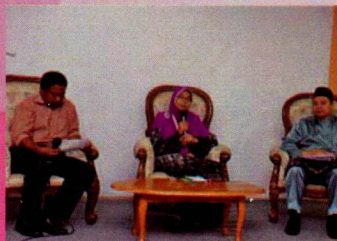
15 July 2011 - Welcoming the blessed Ramadan