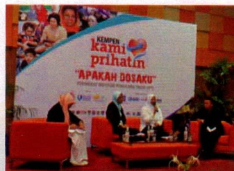
24 January 2011 - 'We Care Campaign: Whats My Sin' and Riong Poetry Night