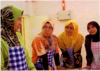
July and August 2011 - How to cook well? Another cooking class at Paya Besar Community College