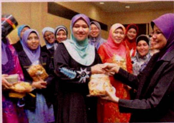
July 2011 -Contributing cookies and lambok porridge to members in conjunction with Eid Celebration