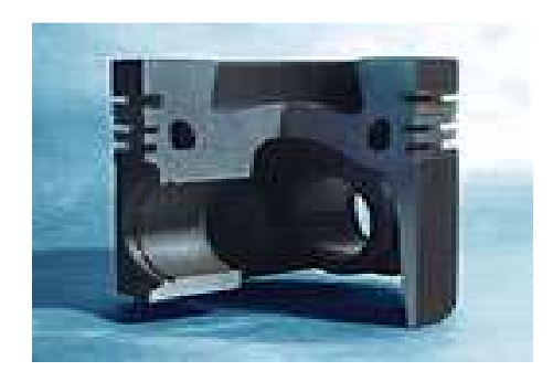
Figure 2.9: Ring carrier pistons with cooling channel and crown reinforcement

This is a piston ring carrier piston with cooling channel and crown reinforcement as shown in the Figure 2.9. These pistons are used in diesel engines under heavy load conditions. For additional protection and to avoid cavity edge or crown fissures, these pistons have a special hard anodized layer (HA layer) on the crown.