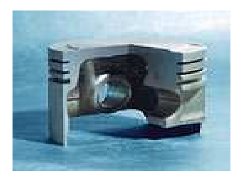
Figure 2.6: Hydrothermatik piston

Mainly, these pistons are used in gasoline and diesel engines for passenger cars under heavy load conditions as shown in Figure 2.6. They have cast-in steel strips but are not slotted. Besides that, they form a uniform body with extreme strength.