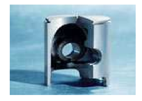
Figure 2.2: Two stroke piston.

Figure 2.2 shows two stroke piston that be made by casting process. These pistons are mainly used in gasoline and diesel engines for passenger cars under heavy load conditions. They have cast-in steel strips but are not slotted. As a result, they form a uniform body with extreme strength.