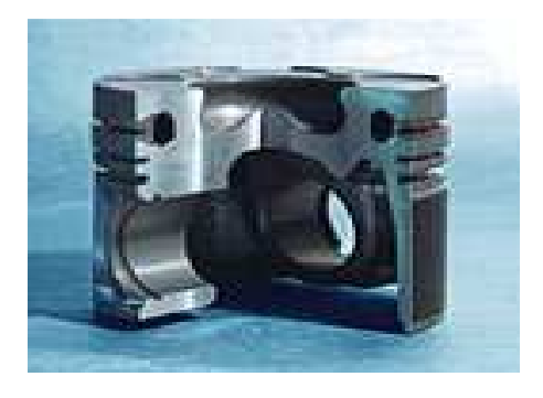
Figure 2.10: Pistons with cooled ring carriers.

For these pistons, ring carriers and cooling channels are combined into one system in a special production process as can say that is combination of ring carrier pistons with cooling channel and ring carrier pistons with cooling channel and crown reinforcement as shown in Figure 2.10. Besides that, this provides the pistons with significantly improved heat removal properties, especially in the first ring groove.