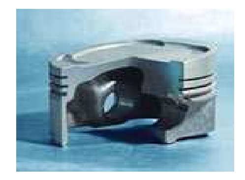
Figure 2.3: Piston cast solid skirt piston.

Cast solid skirt pistons have a long service life. Furthermore this piston more useable that can be used in gasoline and diesel engines. Besides that, their range of applications extends from model engines to large power units as shown in Figure 2.3. Piston top, ring belt and skirt form a robust unit.