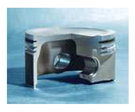
Figure 2.4: Forged solid skirt piston.

For this piston as shown in Figure 2.4, there are made by forged process that gives the piston more strength. This type of piston can mainly be found in high performance series production and racing engines. Besides that, due to the manufacturing process, they are stronger and therefore allow reduced wall cross-sections and lower piston weight. Also, due to relative manufacturing procedures, forged pistons tend to be more expensive than other process.