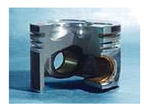
Figure 2.7: Piston ring carrier pistons with pin boss bushes.

This type of pistons is for diesel engines as shown in Figure 2.7. There have a ring carrier made from special cast iron that is connected metallically and rigidly with the piston material in order to make it more wear resistant, in particular in the first groove. Furthermore, the pin boss bushes made from a special material, the load-bearing capacity of the pin boss is increased.