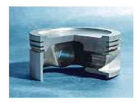
Figure 2.5: Hydrothermik piston.

For this type of piston as shown in Figure 2.5, that gives very quiet running pistons are used primarily in passenger cars. On the other hand, the pistons have castin steel strips and are slotted at the transition from ring belt to skirt section.