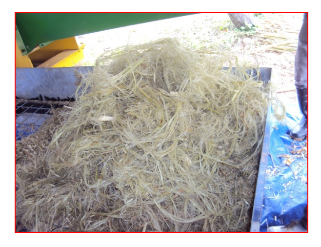
Figure 2: The greenish look kenaf fibre just from the Kenaf Decorticator Machine.