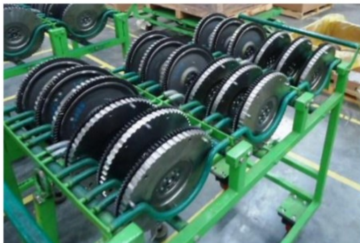
Figure 3. Examples of Minomi Concept [24].

The implementation of SPS is to contribute in the reduction of wastes known as Muda (waste), Muri (Overburden) and Mura (Unevenness). The SPS is known by using minomi concept. This concept used no containers for supplying parts to the production line assembly as in Figure 3 [19]. At Toyota, the minomi concept is used after stamping process of coiled steel in which the parts are stacked together based on their shapes which can reduce motion waste, scraps and scratches.