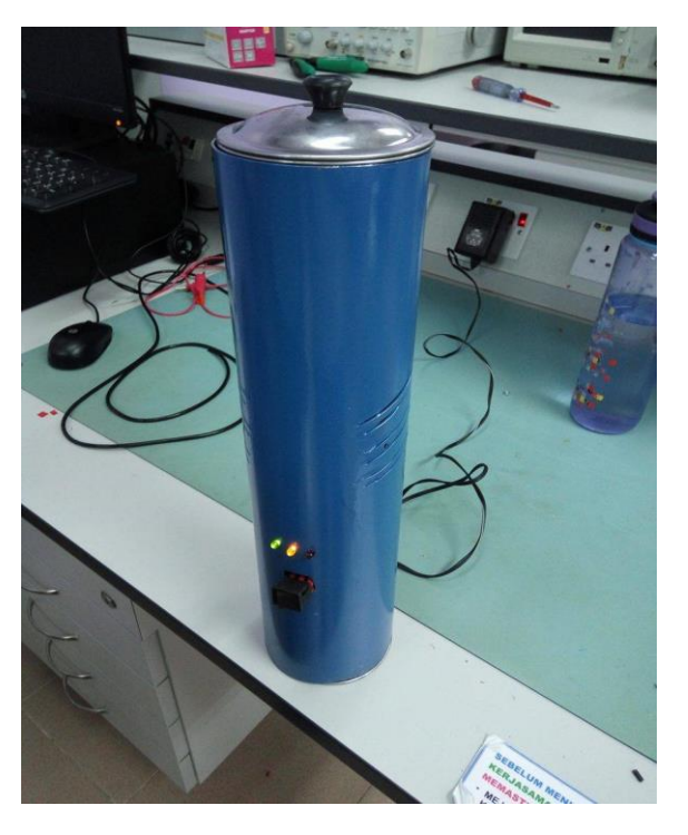
Figure 3: Assembly of the Hot Cold Tumbler

Figure 3 shows the finished tumbler model; this photograph was taken while testing.