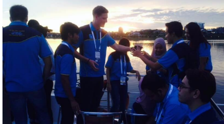
YPN members taking a break on the cruise