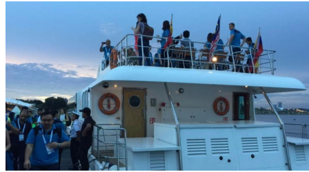
YPN members boarding Putrajaya Cruise