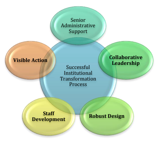
Fig. 1: Five core strategies for successful institutional transformation process (Kezar and Eckel, 2002)

The success of HEIs transformation requires carefully planned and organized conversion process. practical mechanism Apart from that, implementing these strategies also should be meticulously carried out and supported from the bottom up and vice-versa. Hence, Kezar and Eckel (2002) identified 5 core strategies to ensure the success of institutional transformation involving HEIs: senior administrative support, collaborative leadership, robust design, staff development and visible action as depicted in Fig. 1. These strategies were derived from teleological models which propose transformation or change requires "strategic planning", "bureaucratic and scientific management" and "organizational development" (Kezar and Eckel, 2002).