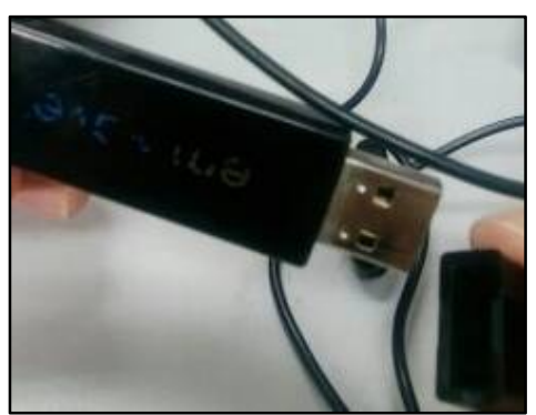
Figure 1: Hearth Math EM Wave Tools

For clinical experimental studies, the tools used were Heart mart biofeedback tools along with the software programmed in the laptop of the researcher. HRV value readers are taken before and after the study. The instrument used in this method is shown as per figure below.