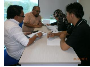
Figure 2. Group discussion to solve problem based on case studies.

forms will be marked and the result of all the evaluation will be analyzed in order to determine their achievement of knowledge regarding hydrogen sulphide through this hydrogen sulphide awareness training.