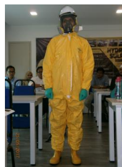
Figure 1. Complete PPE when exposed to hydrogen sulphide (H 2 S).

Fifth module discussed about Personal Protective Equipment (PPE) training. PPE is safety equipment wear to prevent injury in the workplace when engineering and administrative controls fail to eliminate the hazard. This module is aim to all workers dealing with hydrogen sulphide that needed personal protective equipment (PPE) is correctly selected, maintained, provided and used to protect form H 2 S exposure. Other than that, it involves practical training on wearing proper PPE. Figure 1 showed participant wear complete PPE when exposed to hydrogen sulphide (H 2 S).