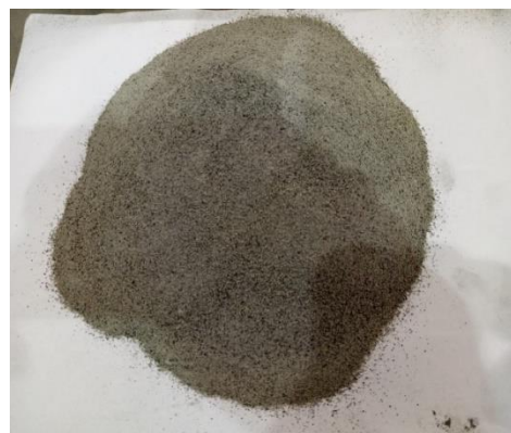
Figure 2. Coal Bottom Ash (CBA).