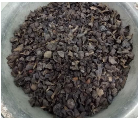
Figure 1. Oil Palm Shell ( OPS ).

The materials used in this experiment are ordinary Portland cement, local river sand, water, water reducing admixture, oil palm shell (OPS) and coal bottom ash (CBA). Tap water at the laboratory was used for concrete mixing and curing work. Coal bottom ash (CBA) shown in Figure 2 was supplied by one of the coal power plant located in West Coast Malaysia. Oil palm shell (OPS) in Figure 1 was supplied by nearby palm oil mill located in the state of Pahang, East Coast Malaysia. The properties of OPS used in this research are tabulated in Table 1.