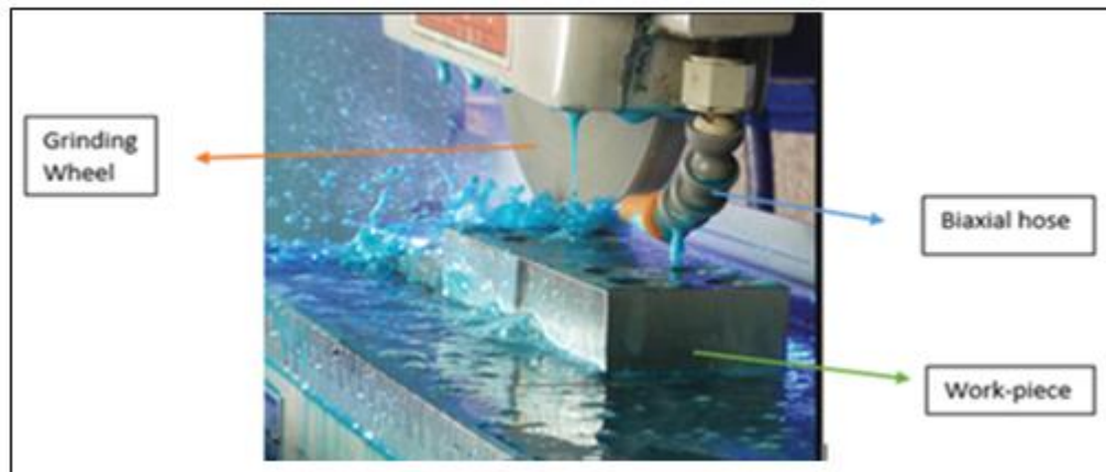
Figure 2. Conventional fluid delivery system (Flood Coolant system).

There are two alternatives available for flood coolant mechanism. One is known as dry grinding and another is near dry grinding (minimum quantity lubrication, MQL). Dry grinding utilizes no cutting fluid, as such, it is not recommended for machining hard materials due to the high heat generation. Since there is no coolant used, the transfer the heat from the contact zone is disrupted resulting in severe thermal damages on the ground surface of the material. These also increase the grinding energy and grinding forces, wear of the grinding wheel, low material removal rate (low depths of cut) and reduced surface integrity compared to conventional flood delivery mechanism [27].