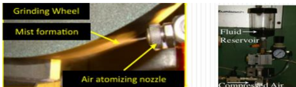
Figure 3. Minimum quantity lubrication (MQL) system.

MQL technique implicates the application of a small quantity coolant dispensed to the tool-work piece interface by compressed air flow. MQL grinding refers to the delivery of a minute quantity of fluid following an aerosol mechanism to the grinding zone for cooling and lubricating the work piece. The MQL lubrication system is as shown in figure 3.