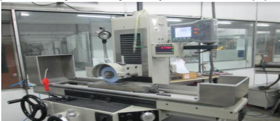
Figure 1. Illustration of whole grinding machine set-up.

The conventional mechanism of applying the coolant is known as flood coolant system, where a large quantity of coolant continuously impinges on the rake face of the tool [28]. The conventional flood delivery method is as shown in Figure 2. This mechanism has several drawbacks such as high cost, high pumping power requirement, and limited practical usefulness. Due to the large fluid delivery, an extensive amount of hazardous mist is generated during grinding process which contributes to health and environmental hazards. However total elimination of this conventional coolant delivery is not recommended because for high depth machining it would shorten the tool life [16]. Another drawback that is associated with conventional flood coolant mechanism is that the hefty amount of fluid would bound its way to the machining surface owing to the chips and swarf obstruction [59].