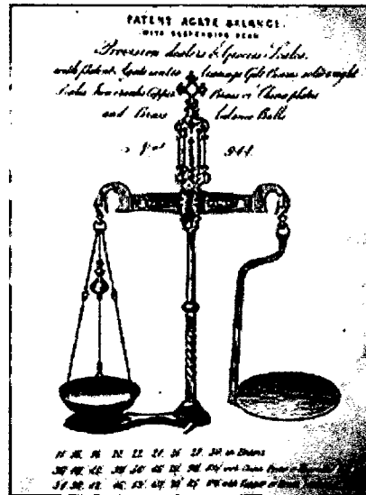
Figure 2.1: Picture of balance, The Avery Historical Museum

Every human being on our planet is affected by weights and measures in some way. From the moment we are born and throughout our daily lives, weighing and measuring are an important and often vital part of our existence. Our bodies, the food we eat and all the products we use as an integral part of modern living have all been weighed and measured at some stage in their development.