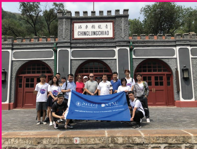
ChingLungChiao Train Station (the 1st Train Station in China)

BEIJING-AUGUST 2018, International Summer School of Sustainable Infrastructure (1-16 August 2018) is the annual event organised by Beijing JiaoTong University. This program was organized as part of the summer school activities including a public lecture, laboratory visit, site visit and industrial visit. Many prominent speakers and experts in the field were invited from France, Norway, China and Malaysia. Besides that, it was also aimed at initiating academic and research collaborations between the universities. I would like to share some of the beautiful moment that I captured during my trip to China.