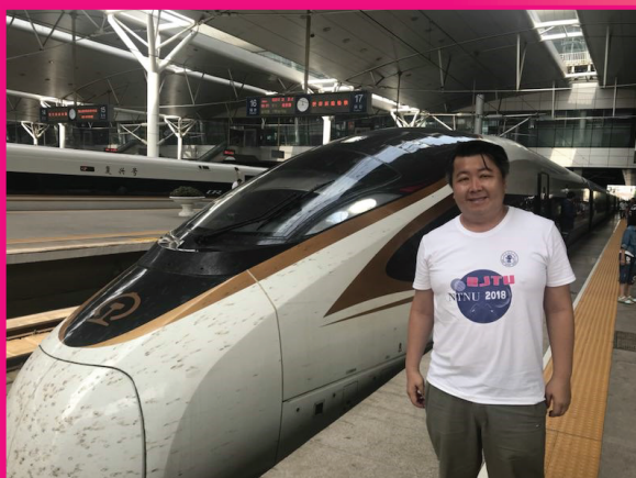
Visit to high speed railway station