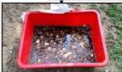
Figure 1: (a) After a few days of fermentation, the IMO was harvested.