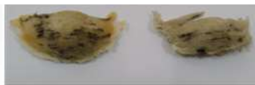
Figure 3: (a) Color changes of EBN induced by bird soil on Day 14; (b) No color changes of EBN after the bird soil treated with ElimiNit.

The contamination of \text{NO}_2^- in EBN mainly comes from the bird-soil, which involved enzymatic reaction by bacteria in natural environment at certain temperature, and humidity. Color of EBN also would become an indicator of \text{NO}_2^- level. The higher the level of \text{NO}_2^- , the color of EBN changes from white to yellowish and brownish.