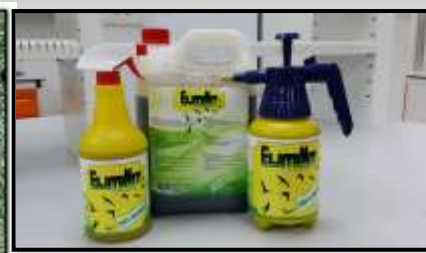
(b) ElimiNit Products