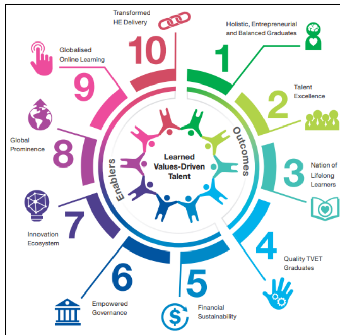
Figure 1. Ten Shifts in The Malaysia Education Blueprint 2015-2025 (Ministry of Education Malaysia, 2018)

The ten shifts are divided into two categories, namely enablers and outcomes. The enablers are key components that contributes towards the outcomes; without enablers, the level of quality of the outcomes would not achieved as intended. The enablers of transforming the higher education comprise of (a) Empowered governance, (b) Innovative ecosystem, (c) Global prominence, (d) Globalized online learning and (e) Transforming the higher education delivery. Based on these five enablers, expected outcomes listed as part of the shifts include (1) Holistic, entrepreneurial and balanced graduates, (2) Talent excellence, (3) Nation of lifelong learners, (4) Quality TVET graduates and (5) Financial sustainability.