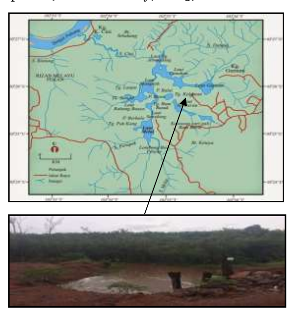
Figure 1. Location of Sungai Jemberau in Tasik Chini

Tasik Chini recently has undergone devastating situation as a lake environment since 1984 or earlier due to development activities in the surrounding areas such as oil palm plantations and residential developments (Gasim et al. , 2009). The conditions of Tasik Chini become worst when a small dam was built in 1995 to retain water in the lake for tourism purposes (Idris and Kutty, 2005).