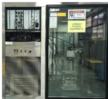
Figure 6. Universal Testing Machine.

RM test was performed following ASTM D 7369-11 [23] under the repeated load using Universal Testing Machine as shown in Figure 6 at 25 Celsius on cylindrical specimens (100mm by 65mm) under different phase (control, wet and dry back). Specifically, specimens were tested in dry condition and as well as tested on 1, 3 and 5 days of water conditioning to check the effect of moisture conditioning period towards asphalt mixture performance. After 5 days testing specimens were stored at room temperature for another 5 days for dry back period and then tested to determine the recoverability of MD in mixture at certain drying period.