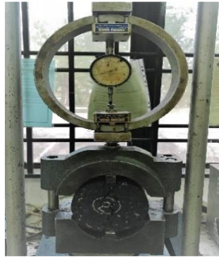
Figure 5. Universal Compression Machine.