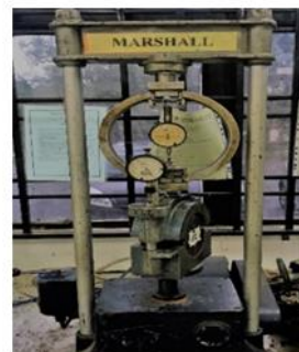
Figure 2. Stability and Flow Test.