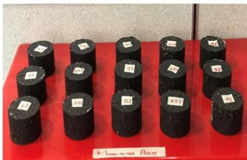
Figure 1. Specimens for Marshall Stability.

Marshall mixture design method was employed in accordance with ASTM 1559 [19] to find OBC that was required for a given blending and grading of aggregates. Moreover, size limits for AC 14 were used according to JKR standard specification [20]. Specimens were fabricated as shown in Figure 1, using specific method of heating, mixing and compacting to asphalt mix aggregate. Marshall stability and flow test were performed as can be seen in Figure 2 on compacted specimen to determine the relative density and mix volumetric (density, Voids Total Mix, Voids fill with Asphalt) to calculate optimum binder content.