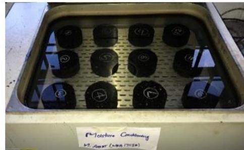
Figure 4. Specimens Moisture Conditioning