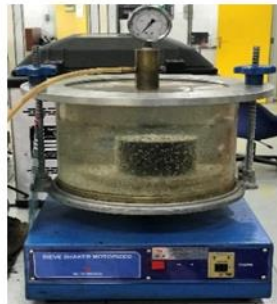
Figure 3. ASTM D4867

To design the asphalt mixture, a standard marshal mix design method was used and 5.2% OBC was determined. The maximum size of aggregate used in mixture was 14mm with 5.2% binder content that had been compacted with Marshall compactor. Overall, 30 specimens (100mm by 65mm) were prepared for conditioning and laboratory testing (Indirect Tensile Strength and Resilient Modulus) to check the mixture performance at various stages (dry, wet and dry back). To evaluate the tensile properties and modulus value of mixture, 6 specimens were put into tests in dry state, whereas the remaining 24 specimens were conditioned as shown in Figure 3 in accordance with ASTM D4867 to examine the impact of moisture saturation of mixture, by immersing the specimens in water under vacuum pressure for 5 to 10 minutes to achieve saturation level up to 80% [21]. Afterward, specimens were immersed in water bath as can be seen in Figure 4 at various moisture conditioning period of 1, 3 and 5 days. At the end of each moisture conditioning period, specimens were taken out of water for the purpose of testing. After 5 days testing, specimens were kept at normal temperature for further 5 days to dry up for testing them again to determine recoverability of moisture damage.