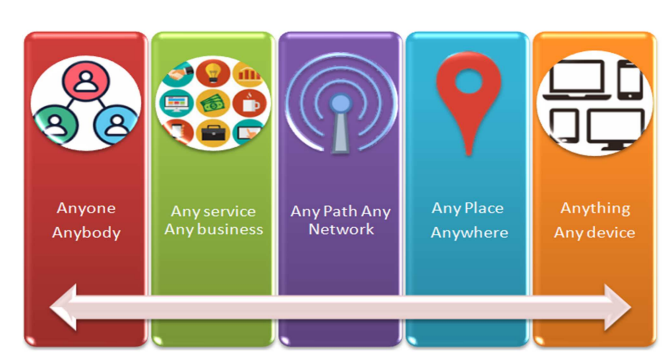
Fig. 1 Definitions The Internet of Things

access or to use the technologies and also anything, any devices that available and have embedded with an intelligent system. All of these can be combined and produced one of the Internet of thing to reach and communicates with the people.