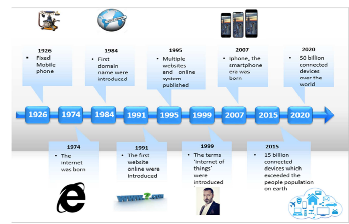
Fig. 3 Evolution of the Internet

In the 1990s, the numbers of Internet connectivity were increased among business sectors and markets. However, due to slow network performance, it becomes limited used of the Internet devices. In the 2000s, Internet connectivity starting became attention for various user applications and were expected to be a part of the industry to access any information [20]. However, the connecting devices are still required human monitoring and interaction in order to maximize the applications. As shown in Fig. 3, the details information was stated regarding the evolution of the Internet in becoming the Internet of Things.