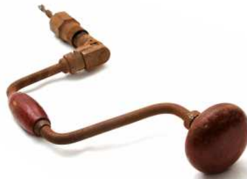
Figure 2.5: Hand drill