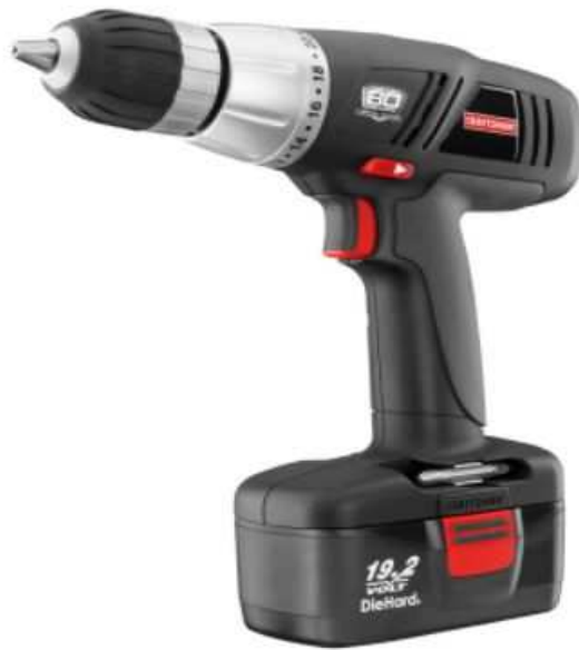
Figure 2.6: Cordless drill

The handles of cordless drills are usually made from polymorph which is easy and quick to mold to a comfortable shape for holding. The main body of the drill is usually made from polythene as it is able to withstand the high temperatures which the drill reaches.[3]