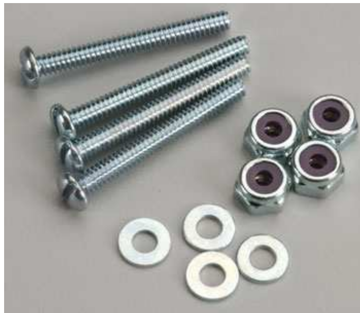
Figure 2.4: bolt and nut

Bolts screw and nuts are among the most commonly used threaded fasteners. Numerous standards and specifications (including thread dimensions, dimensional tolerances, strength and the quality of the material used to make these fasteners) are described. Bolts and screw may be secured with nuts, or they may be self tapping is particularly effective and economical in plastic products where fastening does not required a tapped hole or nut. If the joint is to be subjected to vibration (such as an aircraft, engines, and machinery) several especially designed nuts and lock washers are available. They increase the frictional resistance in tensional direction and so inhibit any vibration of the fasteners.[1]