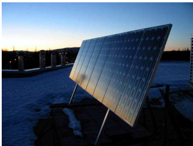
Figure 2.1: Solar panel

Ancient Greeks and Romans saw great benefit in what we now refer to as passive solar design—the use of architecture to make use of the sun’s capacity to light and heat indoor