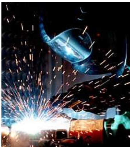
Figure 2.2: Gas metal arc welding (GMAW)

Gas metal arc welding (GMAW) , sometimes referred to by its subtypes metal inert gas (MIG) welding or metal active gas (MAG) welding , is a semi-automatic or automatic arc welding process in which a continuous and consumable wire electrode and a shielding gas are fed through a welding gun. A constant voltage, direct current power source is most commonly used with GMAW, but constant current systems, as well as alternating current, can be used. There are four primary methods of metal transfer in GMAW, called globular, short-circuiting, spray, and pulsed-spray, each of which has distinct properties and corresponding advantages and limitations.