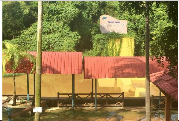
Figure 3. Chini River, Tasik Chini