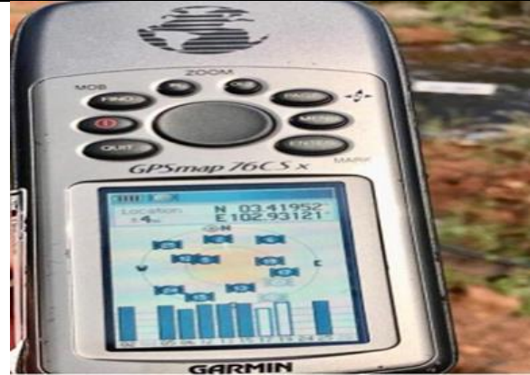
Figure 2. Coordinate for Jemberau River