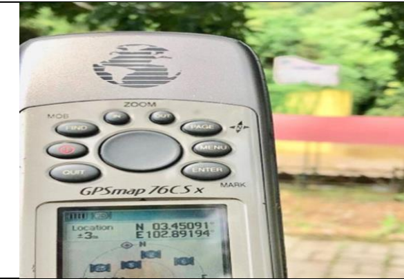
Figure 4. Coordinate for Chini River