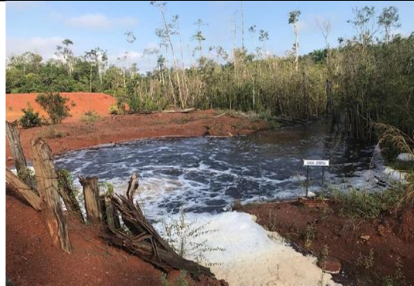
Figure 1. Jemberau River, Tasik Chini