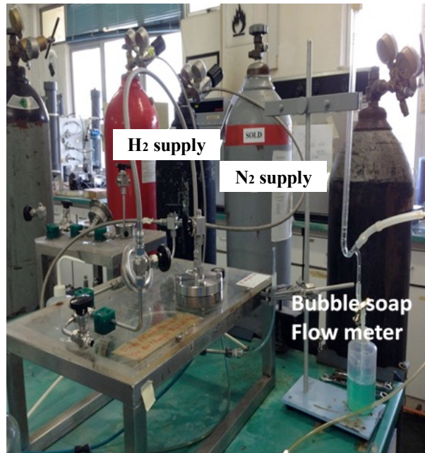
Figure 2: Gas permeation apparatus

where P/l represents gas permeance, Q_i represents gas volumetric flow rate at STP ( \text{cm}^3 (STP/s)), p denotes pressure difference (cmHg), A is the effective surface area ( \text{cm}^2 ), n signifies the number of fibers, D represents the membrane outer diameter (cm) and l is the fiber length (cm). The selectivity, on the other hand, can be defined as the permeation ratio of fast gas over slow gas permeation.