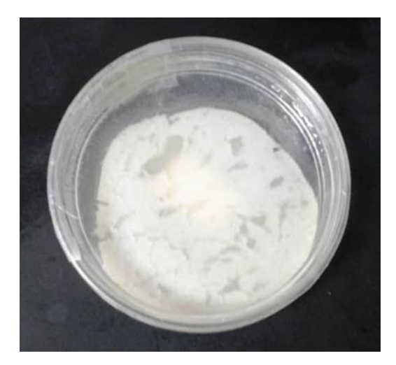
Figure 3. Phase separation of F4 at temperature 45 °C \pm 70 % RH for 48 hours.