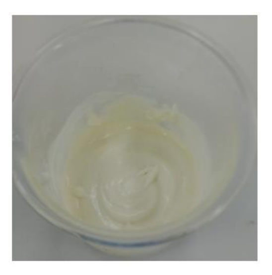
Figure 2. Formulated cream

The present study was performed to formulate and evaluate the herbal cream. Creams are semisolid dosage forms intended mainly for external use and commonly consist of two immiscible phases, an oily phase and an aqueous phase in range of 39.9 to 44.9% of w/o. In this study, aqueous phase was added into the oil phase which is a combination of polysorbate 80, castor oil, stearic acid and beeswax. Based on previous study, w/o cream is the most suitable formulation of cream in skin care cream product because they give more moisturising effect as they provide an oily barrier which reduces water loss from the outermost layer of the skin [14]. Figure 2 depicted the cream formulation based on the formulation stated in Table 1. All formulated herbal cream showed light green coloured, which was the color obtained from natural leaves extract and produced mildly aromatic odour.