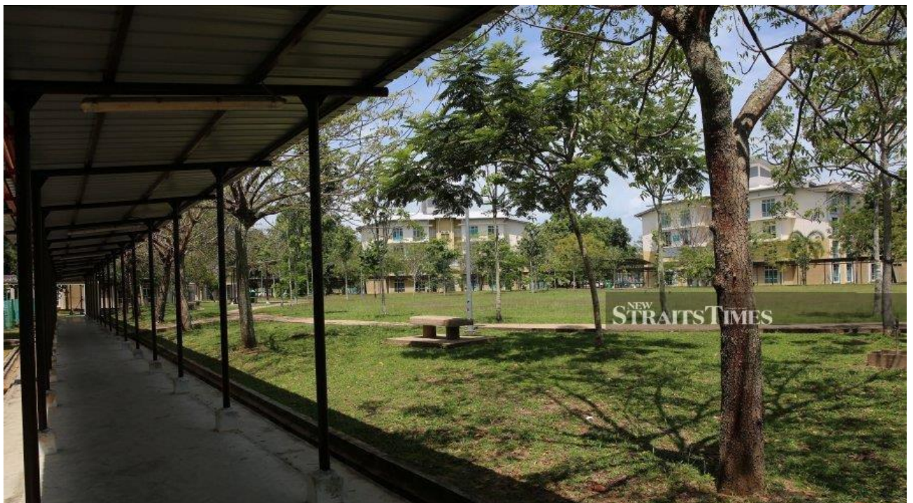
UMP has prepared an action plan to ensure students return safely to the campus.

"Those staying on campus will leave the hostel in the early morning and only return late at night... they spend long hours at the laboratories and other parts of the campus to perform tasks related to their programmes. Even the discussion sections or meeting areas provided at the food court have been left unoccupied for quite some time.