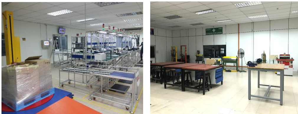
Figure 3: The Set-up of the Assembly Line and Fabrication Workshop

A pilot study on the learning factory facility has been conducted from October 2017 and lean management subject has been chosen to be used in the learning factory. To illustrate the one-piece flow concepts, the workstations were arranged in a linear way next to one another with the sub-assembly process connected directly to the main assembly line. The learning factory flow allows the students to experience the whole supply chain process from parts receiving process until finish goods warehouse. The following pictures illustrate the set-up of the assembly line and fabrication workshop as shown in figure 3.