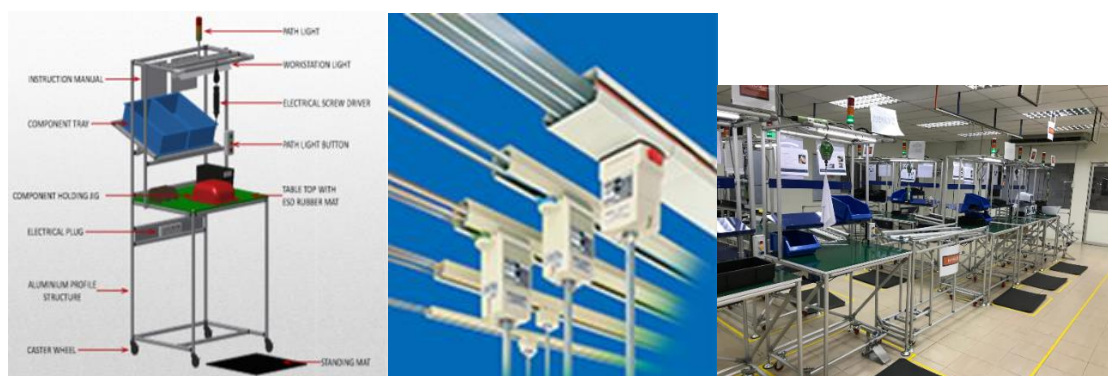
Figure 1: Various Equipment Installed in the FIM Learning Factory

The initial size of the learning factory is 588 square meter which is located in block T of the UMP Gambang campus. The learning factory comprise of a warehouse, a hand dryer manual operated assembly line, inspection processes, packaging processes, and a small fabrication workshop. This is to create a business environment where the young students will be able to know, experience and solve a real life problem in a small manufacturing setup. The flexibility, changeability and reconfigurable that characterized the learning factory will allows the students to reconfigure the assembly process based on a task assigned such as continuous improvement and optimization study. To expose the students with the concept of flexible production, changeable, cellular system, and reconfigurable production system, the learning factory was equipped with the following system: A changeable workstation using highly flexible plug-in system of tabular standard aluminium profile frames which can be easily mounted or knocked down, thus, allowing changeability. In addition, a flexible overhead wiring system has been installed to allow the wiring system to be easily installed or removed when needed and a cellular production system to allow the assembly process to take place. Figure 1 shows various equipment installed in the learning factory