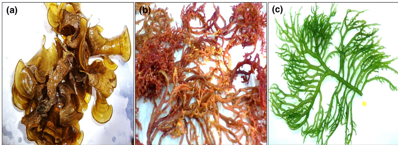
Fig. 1 Marine seaweed samples a (Phaeophyceae) Brown variant ( Padina gymnospora ) b (Rhodophyta) Red variant ( Kappaphycus alvarezii ), and c Green variant ( Kappaphycus striatus )

temperature [2, 3]. They also claimed that the research showed the extraction temperature is one of the factors which is responsible for the yield of extraction. The seaweeds were extracted under reflux using reflux apparatus as this technique prevents boiling dry of reaction vessel as vapour rapidly condensed in the condenser and the boiling can be proceeded at a constant temperature [2, 3, 20]. Besides, different methods can also be used to precipitate out polysaccharides other than using ethanol and determination of the yield of polysaccharides in order to identify the best method for precipitating polysaccharides. Besides, other extraction method of extraction such as methanol extraction, microwave and ultrasound extraction can also be carried out in order to identify the most suitable method in extracting high yield of polysaccharides from seaweeds.