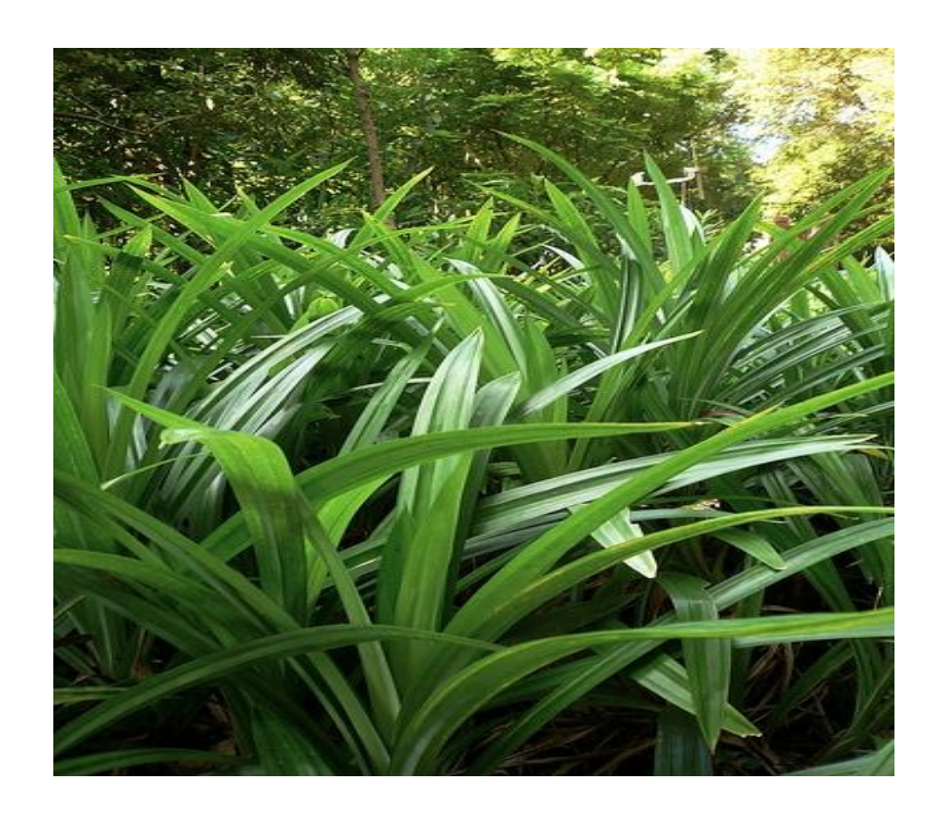
Figure 1.1 : Image of Pandan leaves

The major component contributing to the flavor characteristic of pandan is 2acetyl-1-pyrroline (2AP) .This hydrophilic compound has an odor threshold value as low as 0.1 ppb in water. 2AP is also significantly contributing to the flavor of rice varieties such as basmati and jasmine rice. It has been reported by Buttery et al. that quantities of 2AP present in pandan leaves (of the order of 1ppm) is more than 10 times of those found in scented milled rice like basmati and 100 times of those found in common rice. According to Wongpornchai et.al ,2AP is also occurs naturally in fresh Vallaris glabra Ktze (bread flower) leaves with a concentration of 0.53 ppm. However, it is important to note that pandan leaf is one of the best natural sources of 2-AP.