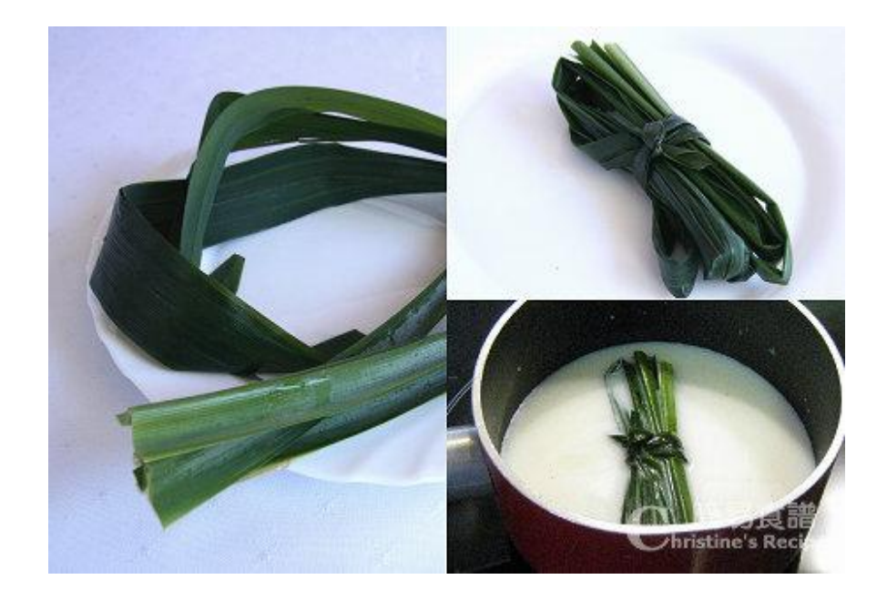
Figure 1.3 : Use of Pandan leaf in dishes