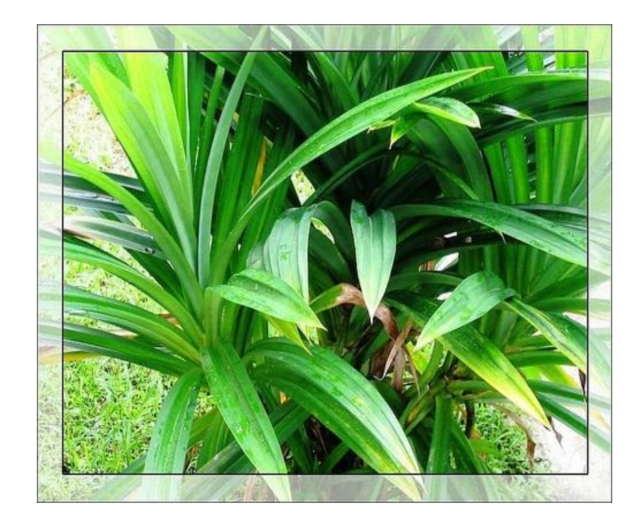
Figure 1.2 : Image of pandan leave