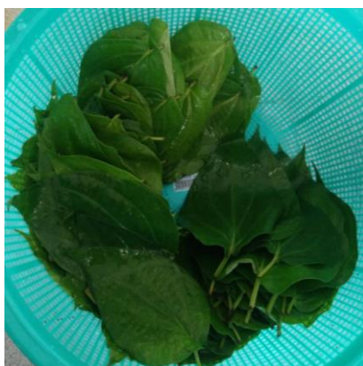
Figure 1. Piper betle leaves

Piper betle (Figure 1) belongs to Piperaceae family with genus Piper [16][17]. The genus Piper has more than 1000 species across the globe and about 300 species can be found in Southeast Asia [3][11][18]. Among the many species, Piper betle , Piper sarmentosum and Piper caninum are the three (3) most common species in Malaysia [18]. Table 1 shows the taxonomic hierarchy for Piper betle [10][19][20][21].