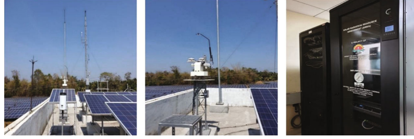
FIGURE 2: Dedicated SRRRA station at the site and central data server for the real-time collection of the data.