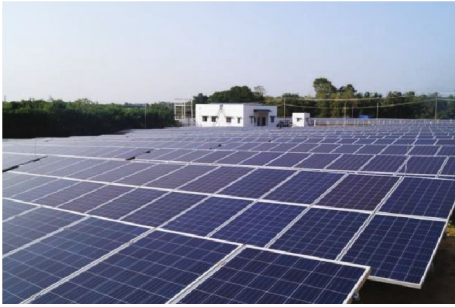
FIGURE 1: Site view of ANERT 2 MWp Kuzhalmannam solar PV power plant.

data and not based upon an hourly average or daily average. Hence, the results and the conclusion in the referred studies have the limitation of detailed hourly/daily analysis.