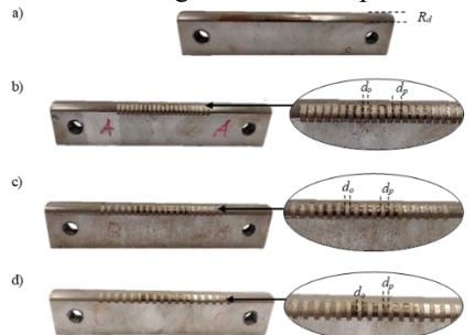
Figure 1: The die inserts with DSPM a) no pattern, b) P1, c) P2, d) P3

A novel die surface patterning technique (DSPM) to improve the structural integrity of hat-shaped components is introduced as shown in Figure 1 in which the die insert was designed with a rib pattern.