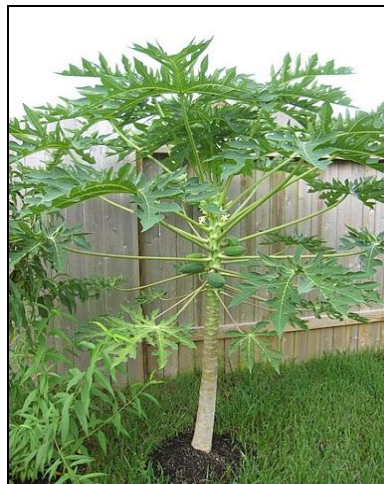
Figure 1.1: Papaya tree

The papaya plant is a small tree which is from Caricaceae family. It is originated from the lowlands of eastern Central America, from Mexico to Panama. Papayas have many common names such as pawpaw tree, papaya, papayer, tinti, pepol, chich put, fan kua, and kepaya. Papaya is a large tree-like plant with a single stem growing from 8 to 10 metres tall. Papaya leaves are large, 45–70 centimetres diameter, deeply palmately lobed with 7 lobes. The fruit is ripe when its skin has attained amber to orange hue and has bitter sweet taste. Its weight usually is around 2.5kg.