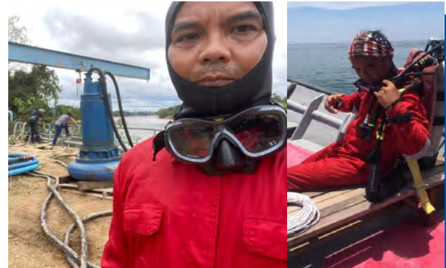
Figure 5. : Onland construction site

Nonetheless, before jumping into such an industry, we might first wish to experience a little deeper on what constitutes commercial diving, how it works as well as what are the essential and desirable skills expected. For such initial exposure, FTKMA in collaboration with Akademi Adab hopes to open up avenues for students to delve deeper into the world of commercial diving by promoting its potential at the university's level.