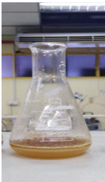
Figure 2. Soap formation in conversion of spent cooking oil with KOH