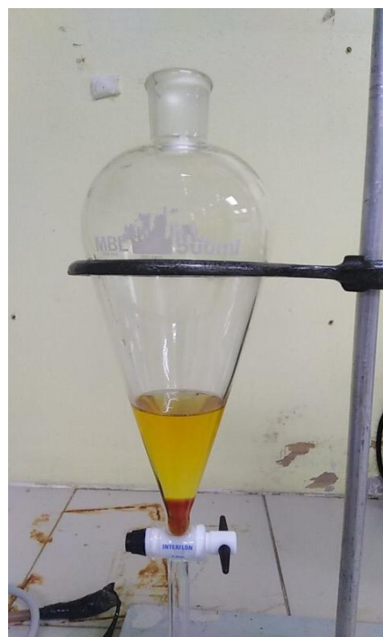
Figure 3. Two layers obtained in conversion of spent cooking oil with KOH-Gly