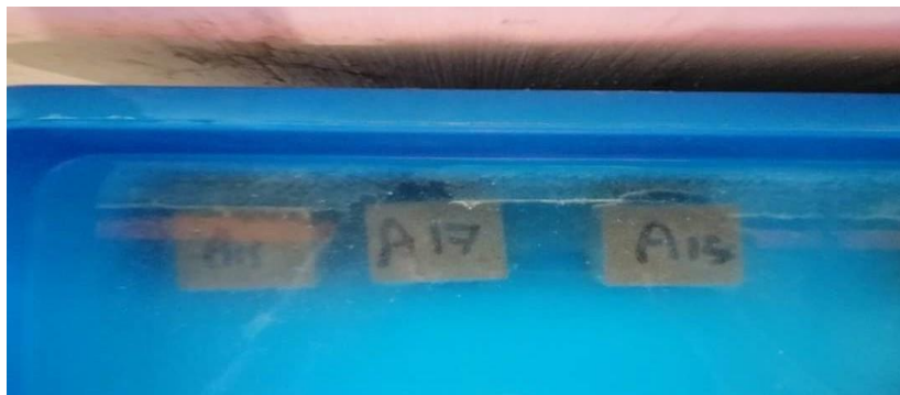
Figure 1. Appearance of specimen out shape

Acid resistance was assessed by immersing the concrete specimens that were cured for 28 days with 5% hydraulic acid solution. The test duration was chosen so that the concrete specimens started to exhibit serious damage. The choice of acid and the acid concentration in solution were made to represent the exposure conditions of concrete in sanitary sewer pipes. cubes (50 mm × 50 mm × 50 mm) concrete specimens were kept fully immersed in acid solution for a duration of 1,3,7 and 28 days. High dosage of acid solution was used because the testing is carried out for short period due to time constraint. Whenever the specimen immersed for long period of exposure to acid solution it was loss itself weight due to acid attack. Acid resistance was evaluated on a weekly basis through visual inspection, the change of the appearance and measurement of the change in weight. Figure 1 show the specimens immersed in acid solution.