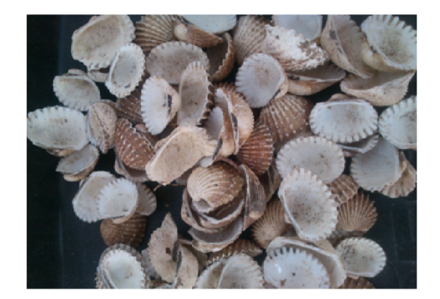
Figure 2. Cockle shell.