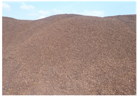
Figure 1. Oil palm shell disposal area.

Ordinary Portland cement (OPC) complying to ASTM C150 [23] was used as the binder. River sand from a single source was used as fine aggregate. Supplied tap water was used for concrete preparation and curing. Oil palm shells were collected from dumping area in the area of palm oil mill as illustrated in Fig. 1. The oil palm shells used is produced from palm oil tree of Dura species. Oil palm shells were cleaned to ensure it is free from debris. Then it is oven dried before kept in a closed container. Cockle shells shown in Fig. 2 were obtained from the dumping area nearby cockle processing location. Then, the shells were washed to remove the sands and dirt on its surface. Then it was dried before crushed into fine particles.