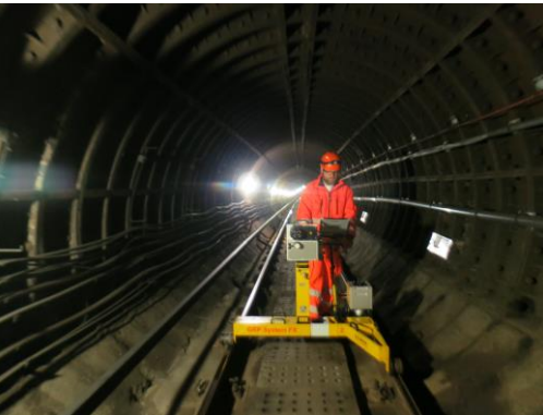
Figure 4. Amberg Mobile Mapping.

Amberg GRP VMS adopts the relative measurement principle based on absolute control, which perfectly combines absolute measurement and relative measurement, and uses CPIII more efficiently, which can greatly improve the measurement efficiency while ensuring high accuracy. The system consists of a data collection car and a satellite car. In addition to integrate mileage, super-elevation and gauge sensors, the data collection car is also equipped with a control point measuring instrument, which can measure the horizontal and vertical distances from the track to the control point. A total station with automatic target tracking function is installed on the satellite launching trolley. The total station uses an automatic levelling base without manual levelling, which can save a lot of time. A wireless communication device is used for communication between the two cars. The product has been tested by the German market and has mature performance [13].