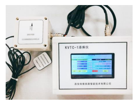
Figure 12. Portable line tester.

Portable line tester is one of the important line test equipment. It is a kind of high-tech testing equipment that mainly uses the line management personnel to place the portable line detector in the locomotive cab, and judges the line status through the vibration acceleration during train operation. By using the checker to add trains, it is possible to timely and accurately find the faulty location of the line, and carry out targeted repairs to prevent the aggravation of the disease, improve the maintenance efficiency, ensure the quality of the line, and ensure the safety of the train [26]. However, the currently used portable line detectors have the following problems, among which mileage drift is one of the most common data quality problems in the current track dynamic detection data. In order to solve the problem of mileage drift, Qin Jinqing adopted a new type of portable line detector based on inertial sensor components, which effectively improved the accuracy of mileage calculation and calibration of urban rail transit line detection data [27].