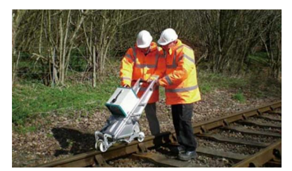
Figure 6. Hand Push Portable Rail Defect Detector.

Portable rail detector is a multi-channel defect detection device that uses ultrasonic probes to detect defect inside inservice rails. It is mainly composed of a defect detector host, a probe, a water tank and a carrier trolley, etc., in addition to a display that can display the rail defect in real time, and the partition displays A-scan and B-scan images for on-site observation by defect detectors. However, the defect detection trolley requires the maintenance worker to push forward, and there may be underreports while walking. Therefore, the data collected by defect detection generally has to implement the secondary playback mode to detect the defect of the rail, the first time is that the line defect detector employees are at the scene according to the display of the A-type image wave, and judge on the spot whether there is defect to the road section being detected; the second is to send the stored B-type image data to the data centre for playback analysis, and review whether to defect again or not [15].