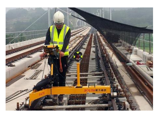
Figure 5. South Inspection.