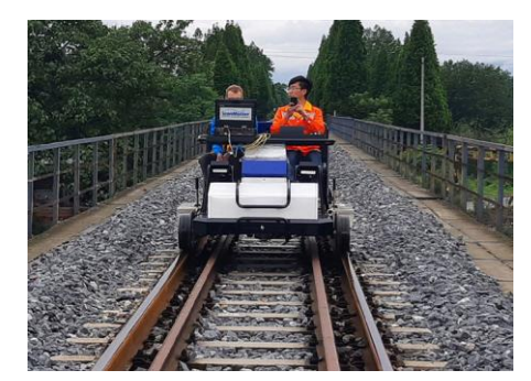
Figure 8. Automatic rail defect detection vehicle.

Due to the higher cost of large defect detectors, small hand-pushed defect detectors are less efficient. Subsequently, engineering research experts invented an automatic two-track trolley, which has better detection performance and higher work efficiency than the trolley, which can achieve effective defect detection [17].