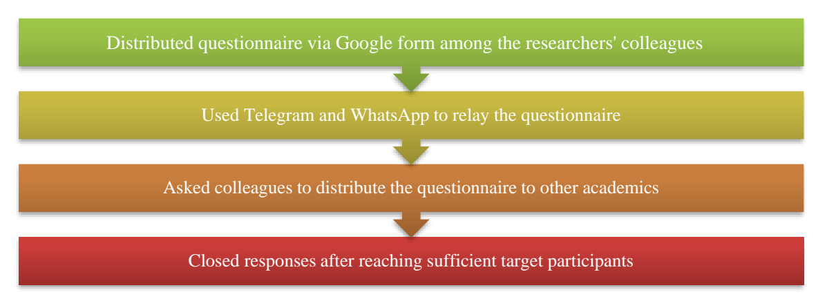
Figure 1: Procedures for collecting data in the current study

In collecting the data for the current study, the researchers randomly distributed the online questionnaires using Google Forms to their colleagues. WhatsApp and Telegram were employed to distribute the online form in that the researchers pasted the link onto the applications. Texts were also written asking their colleagues' a favour to relay the online questionnaire to other academics. The researchers provided a week for the returned questionnaires. The Google form was deactivated when they obtained 66 responses, indicating that no more responses were accepted. Later, data analysis took place. Figure 1 shows a linear procedure for the data collection employed in the current study.