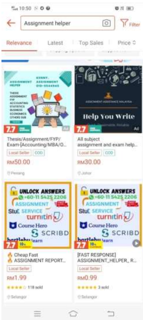
Various contract cheating services are available on Shopee