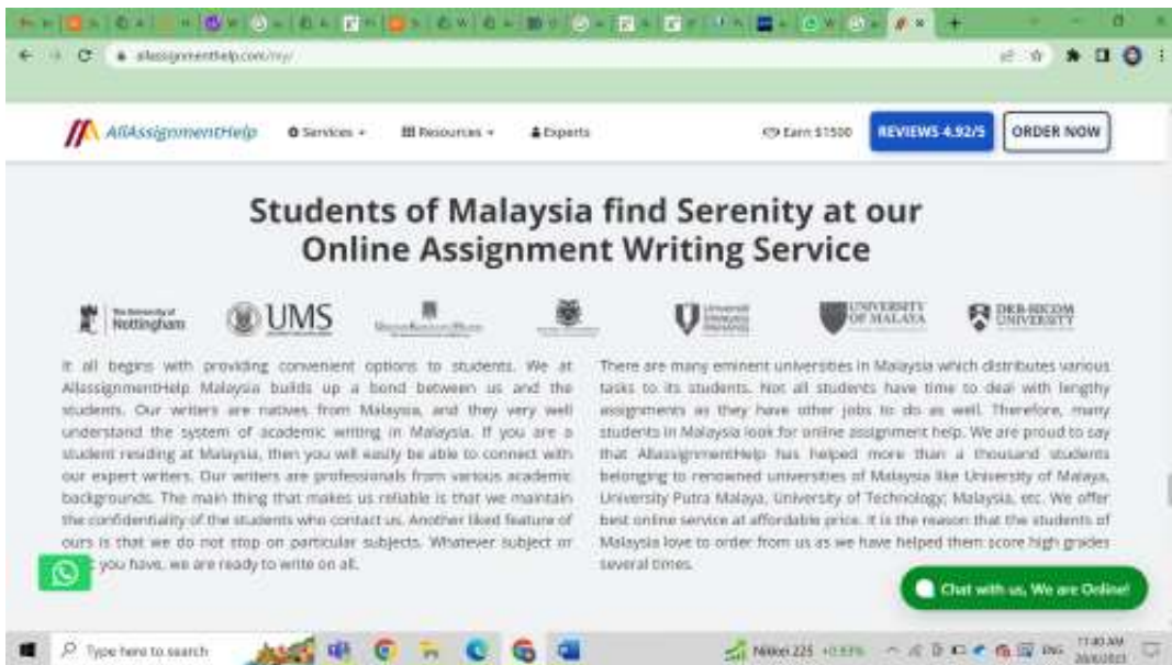
As evidence of testimonials, the university logo is displayed (Screenshot)