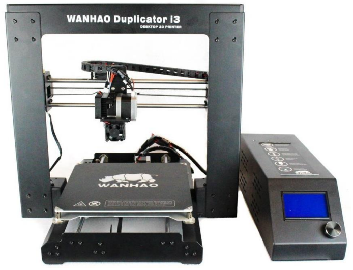
Figure 1: Wanhao duplicator i3 FDM printer

thickness of 0.3mm, speed of 30 mm/sec, and printing temperature of 210^{\circ} C. For each variation, n=5 samples, and a total of 60 samples were printed and the average was taken out. Figure 1 shows the schematic of the FDM printer.